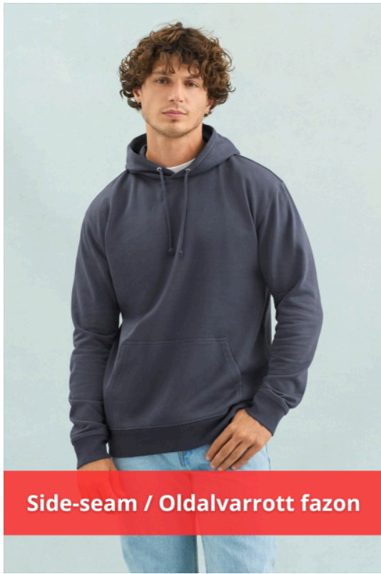
Side-seam / Oldalvarrott fazon